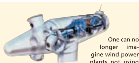
One can no longer imagine wind power plants not using oils for gears and hydraulics or greases made by FUCHS LUBRITECH.

FUCHS LUBRITECH has developed, specifically for use on wind power plants, biodegradable gear oils, hydraulic oils and greases with extraordinary protective properties against wear, which have been successfully used in practice for many years. Thus the biodegradable and fully synthetic GEARMASTER ECO 320 gear oil has been approved for use on wind power plants by the most important gear manufacturers. The same is true for the ECO-Hyd hydraulic oils and the different greases in the ECO-Line with respect to the lubrication of open gears and roller bearings, which have similarly proved themselves over a period of years.