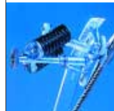
The functional capability of CEPLATTYN ECO 300 for lubricating cable clamps is maintained even at low temperatures.

Possible effects upon the environment must be taken into ever greater account not only for the approval of new cable cars, but also for the operation of existing plant. In order